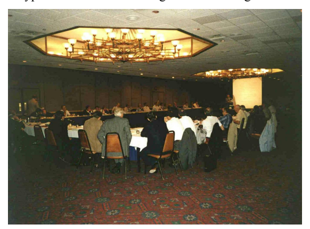
Fig. 1 SCS Board meeting

SCS, the Society for Computer Simulation International was continually informed and updated on the developments related to the fledgling EUROSIM as the author was, at that time also a Director-at-Large on the Board of SCS. UKSC was the UK Regional Council of SCS and had been since its inception in the 1960's. It was agreed at an annual SCS Board meeting, that UKSC could become independent, of SCS, subject to it agreeing to continue to look after its SCS members and to collaborate with SCS. Subsequently, in 1997, UKSC became UKSim and could then legally be a member society of EUROSIM. A typical SCS Board meeting is shown in Figure 1.