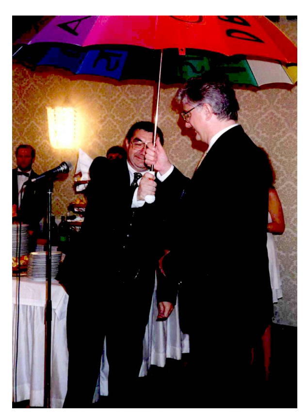
Fig. 5 Handing over of the umbrella, Vienna, 1995