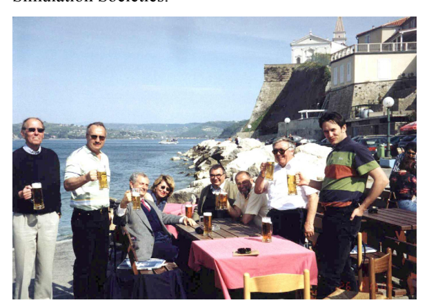
Fig. 8. Piran: relaxation after the EUROSIM Board

publications, well supported by all of the European Simulation Societies.