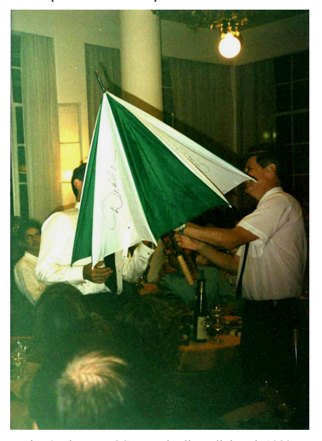
Fig. 4. The EUROSIM umbrella, Edinburgh 1989.

Later that evening, at the SCS Congress Dinner, I was asked to formally announce the establishment of EUROSIM with a short speech, of the cuff with no time for preparation. In anticipation of this momentous event, Prof. David Murray-Smith produced a magnificent EUROSIM umbrella as a symbol of the EUROSIM umbrella organization of European Simulation societies (figure 4). Some 256 European simulationists attended the dinner at which this auspicious event took place.