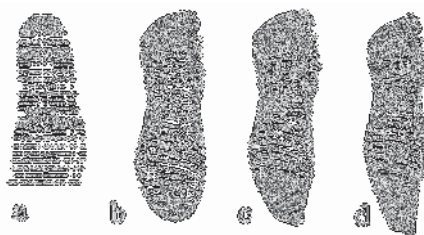
Figure 3. An example of constructing new last models on the basis of a permanent basic part: a – the basic part of the last; b, c, d – foreparts having different form change and taper parameters

foreparts axial lines are insignificant and the surface of the last toe cap can be described by means of a set of two orthogonal families of parabolas.