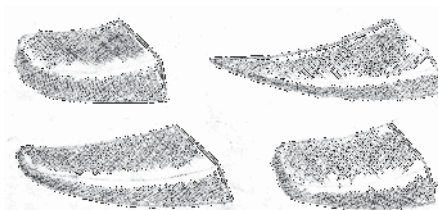
Figure 2. Typical shapes of the foreparts of lasts used during the recent years

The necessity to consider the matter of designing the forepart (starting with section 0.9D) becomes evident as well, if we consider in retrospect some shapes of foreparts of the lasts used in mass production of shoes (Figure 2).